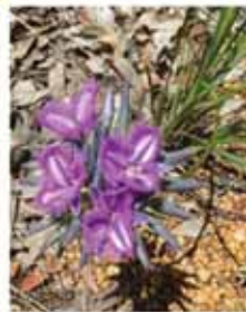
A Fringe Lily

Where: Shire of Mundaring, 7000 Great Eastern Hwy, Mundaring