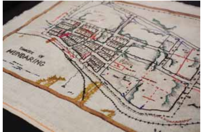
Amelia Sonnekus, From Afar, 2019, cotton thread, ink, hand-dyed vintage bias binding on hand-dyed linen, 47 x 57 cm

As part of the project you can join Wadandi/Minang/Koreng Bibbulmun artist Lea Taylor to learn contemporary Bibbulmun weaving using bush materials, raffia, string and natural fibres. You'll cover the creation of bush baskets, large sculpted baskets and wrapped hay forms in this 4 part course running on Thursdays from 21 March – 11 April.