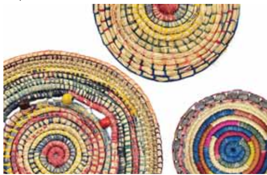
Weavings by recent workshop participants on display for Wallka-yong-a Kaardijin – To Share Knowledge.