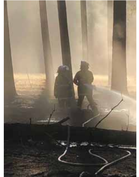
Caption: Members of Chidlow VFBF blacking out at a fire.

all funds raised will go to the RSL. Come along to show your respects to our local service men and women, while benefiting a fantastic organisation in a tasty way at the same time! Breakfast begins serving on the green at 8am, and the march begins at 9.15am, with the service on the village green again at 9.30am. For more information, google "Chidlow RSL."